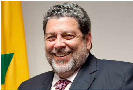
▲ RALPH GONSALVES Prime Minister of St. Vincent and the Grenadines, West Indies

Presented by the African and African Diaspora Studies Program